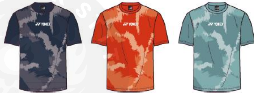
Dark Gun (277)